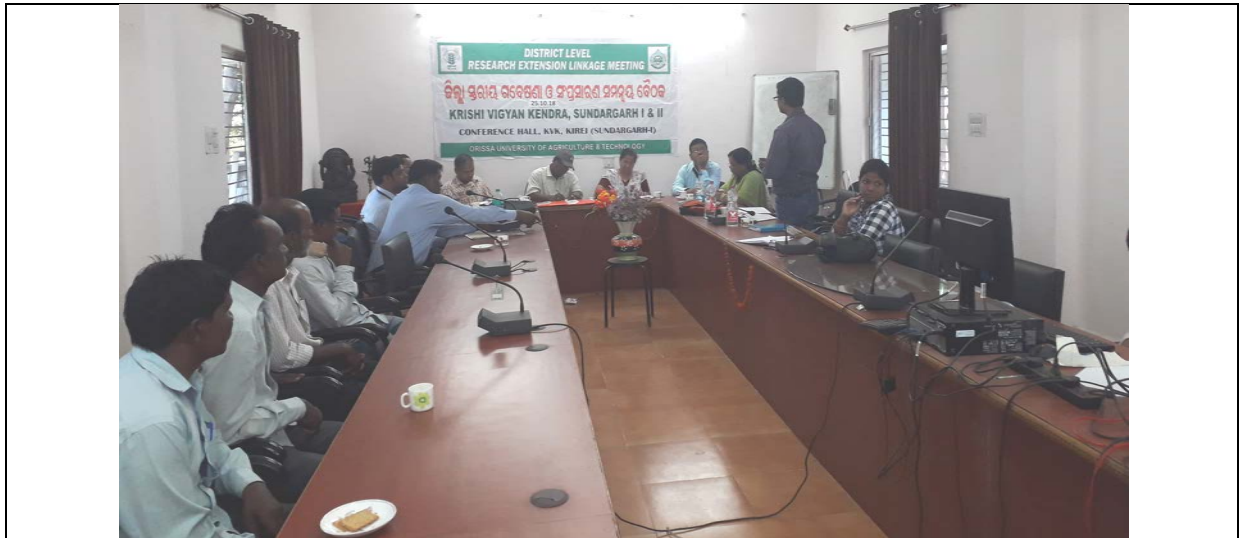
District Level Research Extension Linkage Meeting on progress Chaired by DDH, Sundargarh